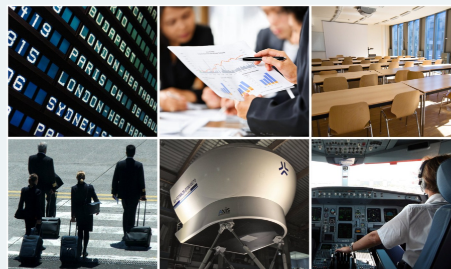
COMPAD® package covers many areas of your airline's business.

You can also integrate it with any operations system or back-office application – it does not make any difference whether you use custom solutions or licensed software. The multi-tenant capability of COMPAD® allows integration with multi-tenant environments.